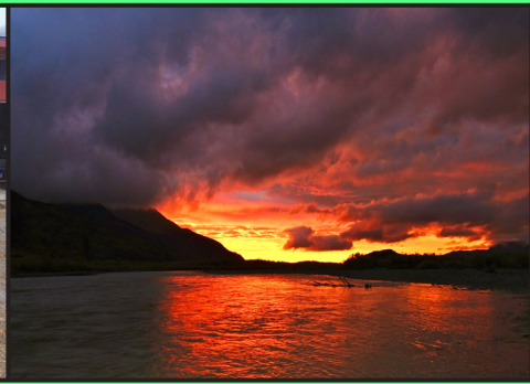
Sunset at - The Dog Salmon