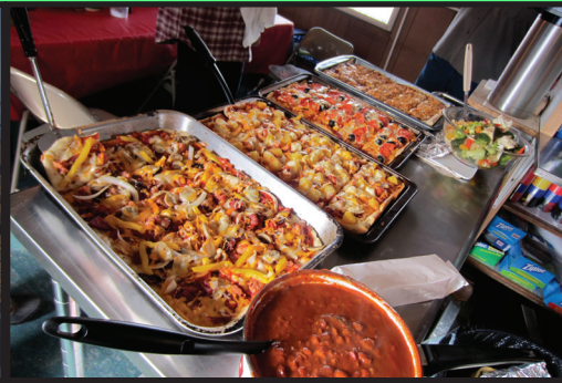
Pizza For Dinner