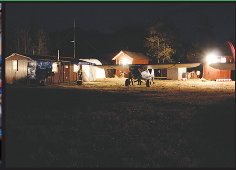
Base Camp at Night

Book early to get the hunts and dates you desire. Most bookings are 2 to 3 years in advance.