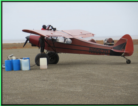
Rob Wing - Pilot