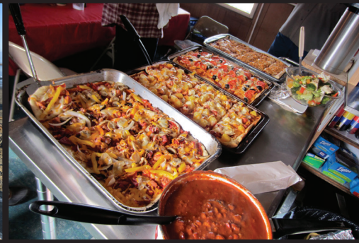
Pizza For Dinner