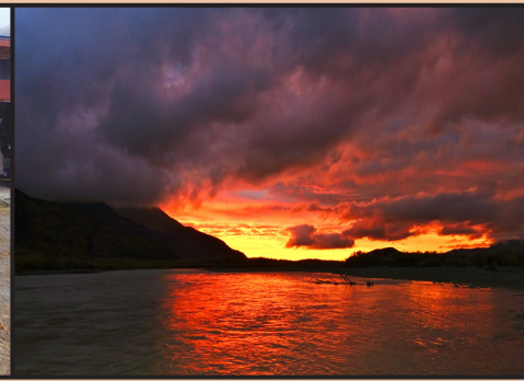
Sunset at - The Dog Salmon