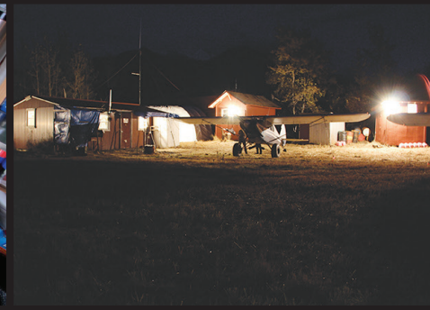
Base Camp at Night

Book early to get the hunts and dates you desire. Most bookings are 2 to 3 years in advance.